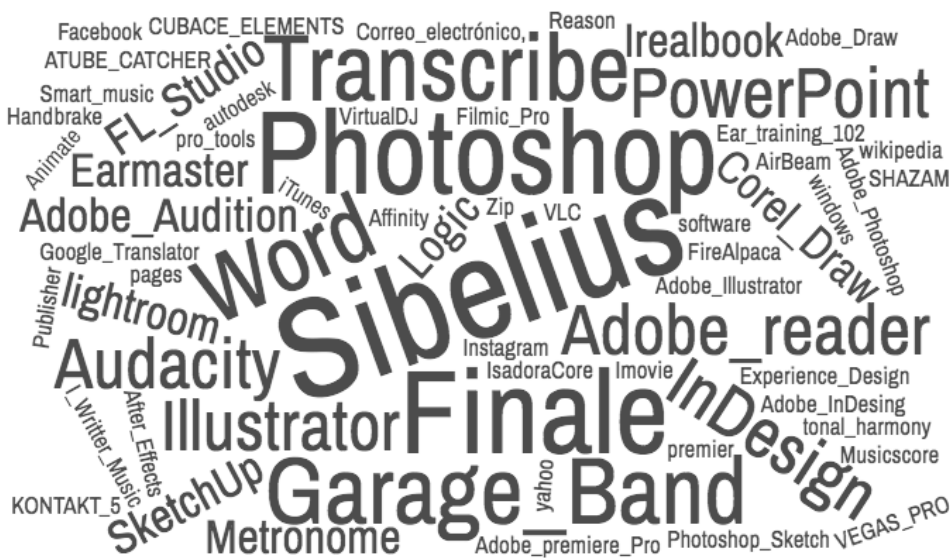
Word cloud of the software used in the arts academic department