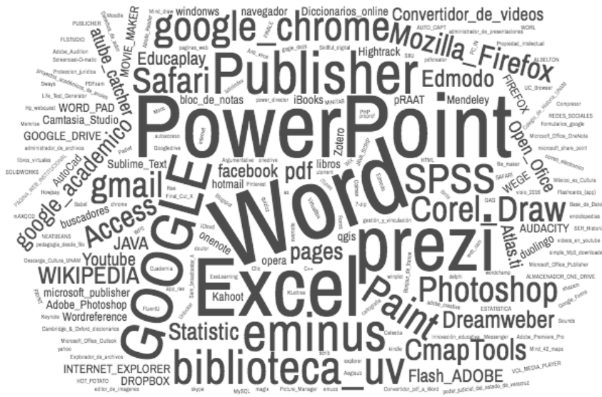
Figure 2 Word cloud of the software used in the humanities academic department

This academic area gathers undergraduate programs in sociology, anthropology, history, social work, philosophy, linguistics and languages, education, and law. The word cloud of this academic area shows an interesting diversity and dispersion of software being used. It is an area with the experimentation of software, but without an institutional agreement on what to use. Microsoft office suites is present in the cloud. Word and PowerPoint were indicated as extremely common among teachers in these disciplines. Part of the software mentioned by teachers in these disciplines are Atlas.ti, Babel, Bonjour de France, Cambridge & Oxford dictionaries, Cuadernia, Edmodo, Educaplay, Evernote, ExeLearning, Hot potatoes, Jclic, Kahoot, MaxQDA, Mendeley, Moodle, Padlet, SPSS, Statistica and Sways.